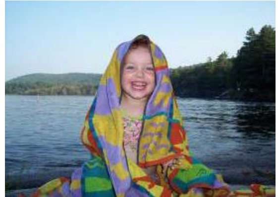
No matter how your favorite lake in New Hampshire was formed, there’s plenty to enjoy!

A few mornings later, much to my surprise, she continued our “how lakes came to be” discussion. “Mom, you know what I think?” I hadn’t a clue, but knew that she was going to tell me. “I think Lake Massasecum was dug out by a bunch of workers with shovels. It took about a week and then they left and dug out Lake