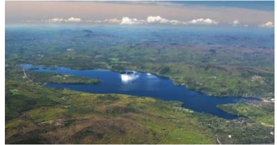
Newfound Lake, the deepest lake in New Hampshire, along with most lakes in the state, was formed by glacial activity.

Most of New Hampshire’s lakes were formed by the movement of glaciers approximately 15,000 years ago. As the glaciers moved across the landscape, tops of mountains and hills were sheared off and other areas of the landscape were gouged out under the tremendous weight of the ice sheet which was, at times, a mile thick over New Hampshire. As a result of this action, the face of the landscape was permanently altered. When the glaciers began to melt and recede north, they left behind huge basins and piles of rocks and boulders strewn across the landscape. Over time, the basins filled up with water, forming many of the lakes we now know. Lake Winnepesaukee, formed by glacial activity, and with a surface area of approximately 72 square miles, maximum length of 21 miles, and width of up to nine miles, is the state’s largest lake. Newfound Lake in Bristol, also formed by glacial activity, with a maximum depth of 183 feet, is the deepest lake in the state.