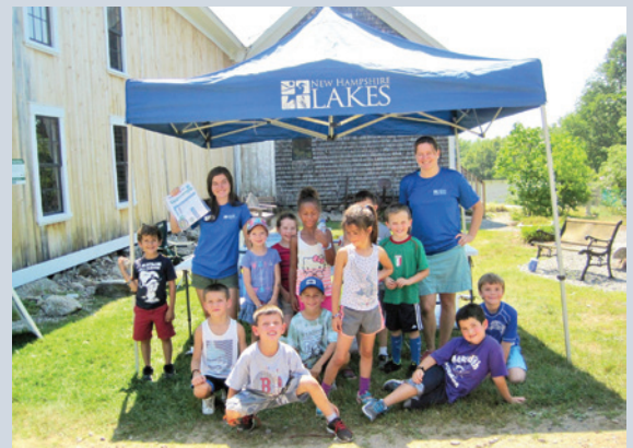
For the second summer, NH LAKES brought the Watershed Warrior Activity Circuit to many summer camps and other family-friendly events. This program was supported by grants from Patagonia and the Davis Conservation Foundation.

We are so grateful to these members and donors listed here along with the 525 Lake Enthusiasts ($50-$99) and others who made charitable contributions to NH LAKES this year. Your unrestricted financial support gives us the ability to continue to respond to lake issues and concerns throughout the state. Thank you!