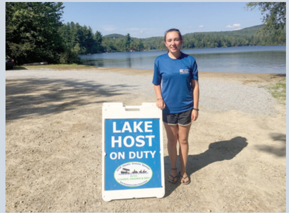
With grant funds from the New Hampshire Department of Environmental Services, NH LAKES made these popular "Lake Host on Duty" signs for all local participating groups.