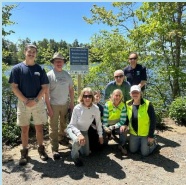
Along Little Lake Sunapee, volunteers gathered for Planting Day to put care into action and help ensure a healthier shoreline for generations to come.