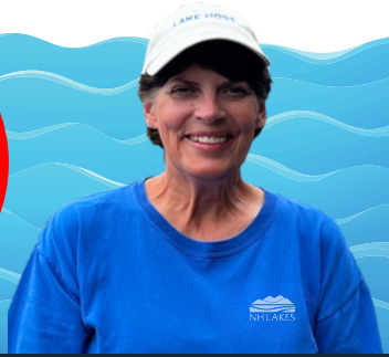
ZEBRA MUSSELS: STOPPED