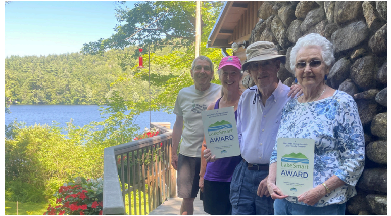
The Buckley family celebrates their LakeSmart Award on Lake Winnepocket—part of a growing community of neighbors choosing lake-friendly living.