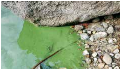
Your support can help stop dangerous cyanobacteria blooms like this one which was observed on Lake Kanasatka this past fall.

Nearly 1,000 bills have been proposed for the 2022 New Hampshire Legislative Session. To learn about some of the many bills NH LAKES is tracking this session visit nhlakes.org/nh-legislature-2022 . And, to stay up to date throughout the session, be sure you are signed up for NH LAKES Advocacy Alert at nhlakes.org/e-news .