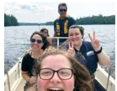
NH LAKES and LWA visited six properties together this past summer.

See what we learned about threats to lake health and how communities are addressing them above.