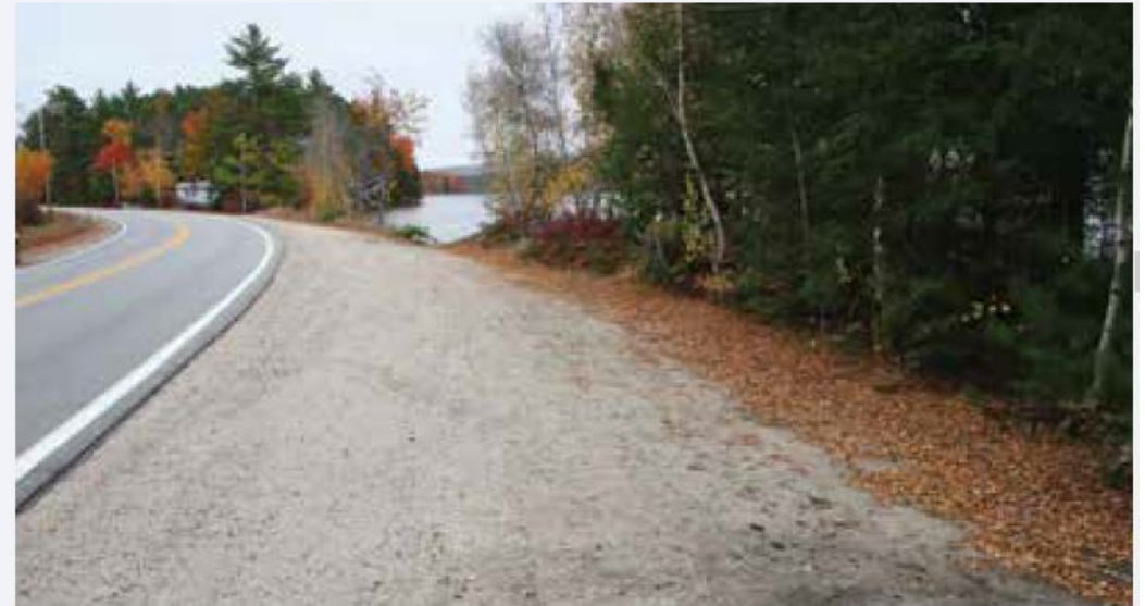
Route 109 Site