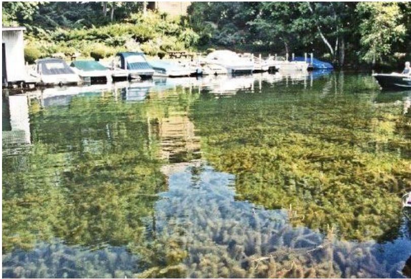
Aquatic Invasive Species Prevention & Management