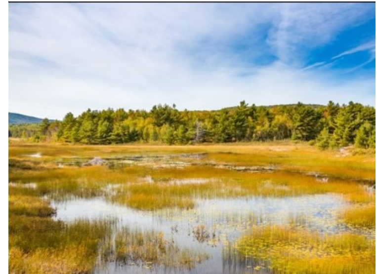
Shoreland & Wetland Protection