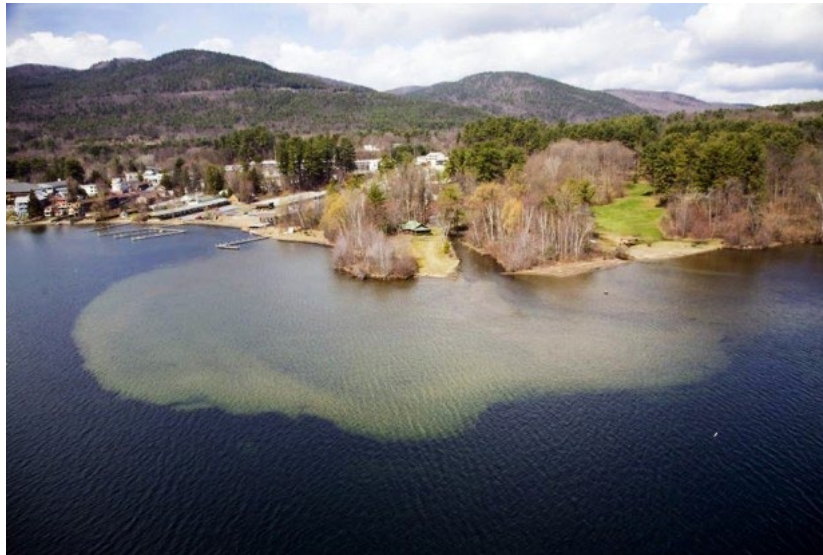
Polluted Runoff Water