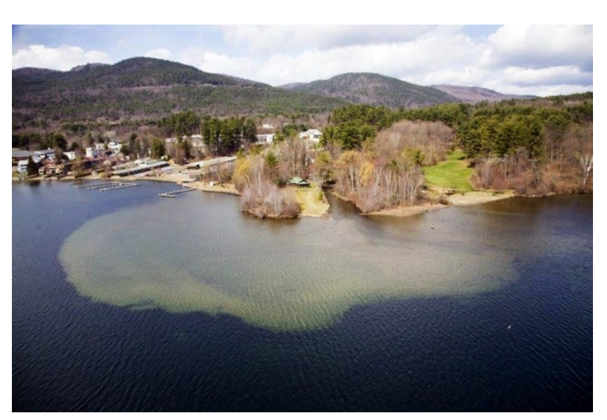
Polluted Runoff Water