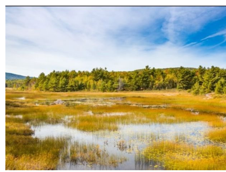
Shoreland & Wetland Protection