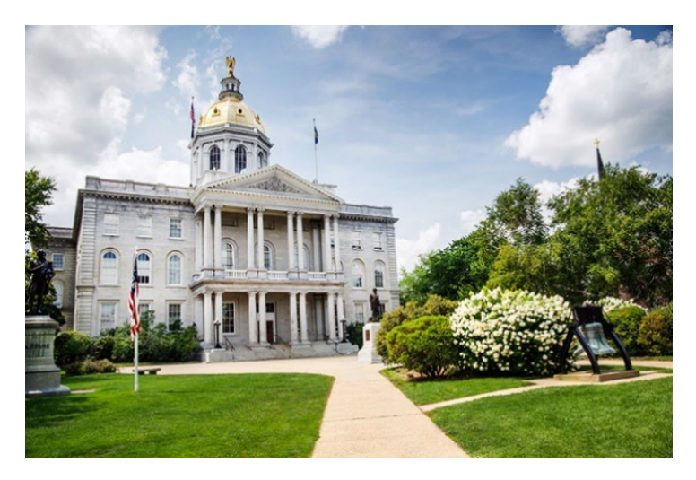
Written/Verbal Testimony Support