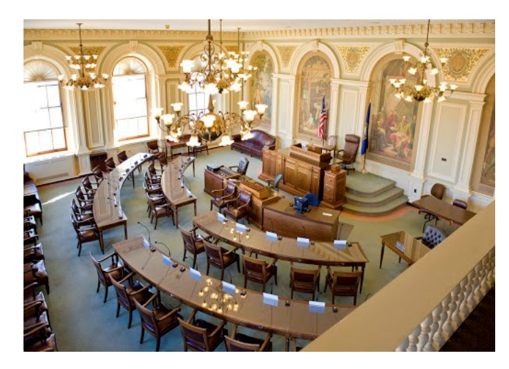
Education & Advocacy Training