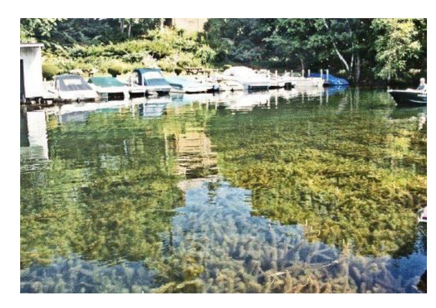
Aquatic Invasive Species Prevention & Management