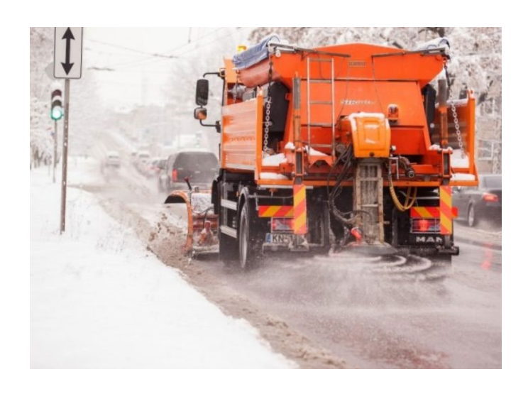
Municipal Level Support